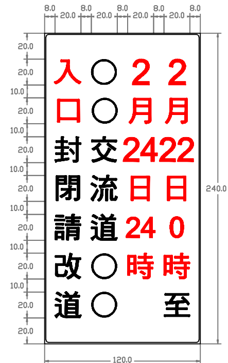
(B or R - B/W)