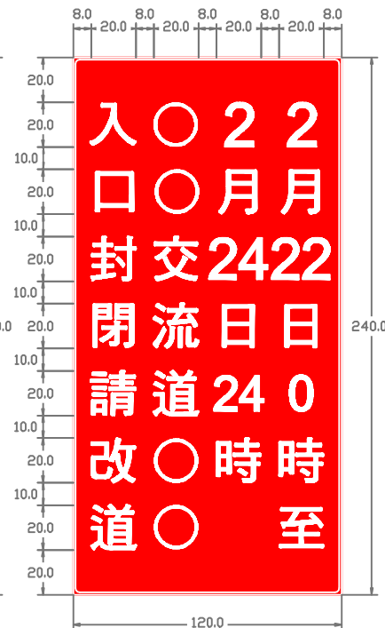
(W - W/R)